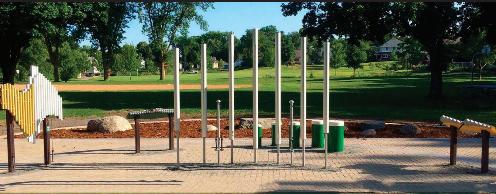
Potential Park Configuration